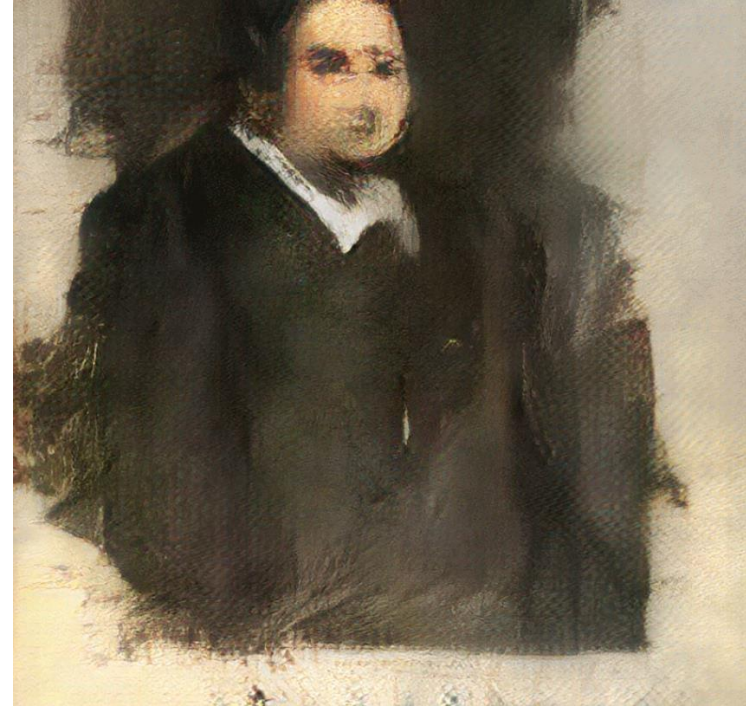
Edmond De Belamy; Medium: GANs Algorithm, Inkjet printed on Canvas.